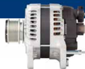
DAN1328 Application table